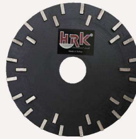
Manual Diamond Abrasive