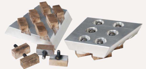
Automatic Abrasive (With Screw)